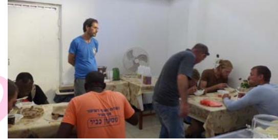
Stocking Kitchen shelves at Tel Aviv Homeless Café