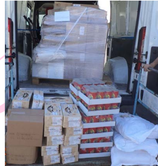
Incontinence Diapers for Victims of the Holocaust in Kiryat Yam