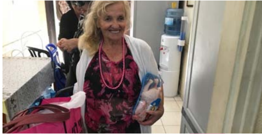
Shavuot Holiday Food bags for impoverished single parents Ramle/Lod