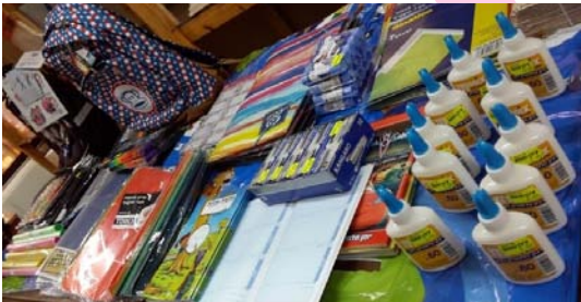
School supplies in August for Sderot kids of families in poverty